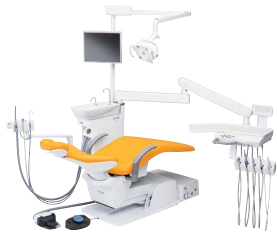
Chair mounted Holder type