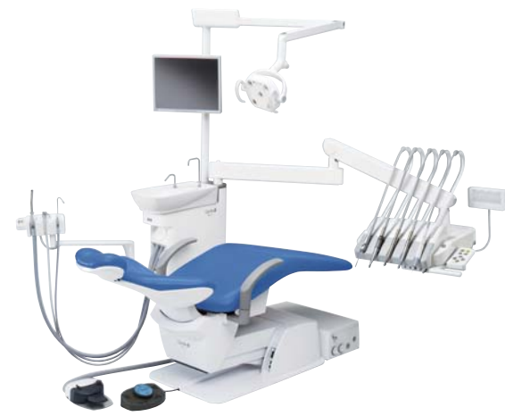
Chair mounted Continental type