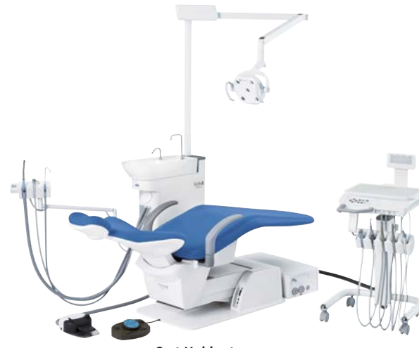
Cart Holder type