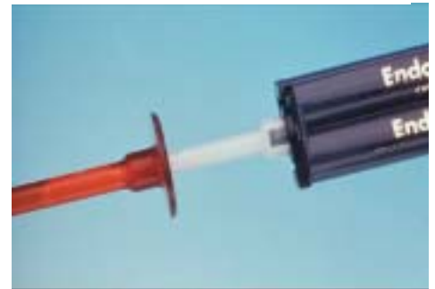
Dispensing Endo REZ