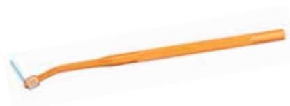
Metal Handle BUTLER

Textured round handle allows precise control under wet and dry conditions. Screw top closure holds refills securely. Handle is autoclavable.