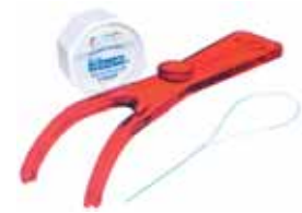
Flossmate Handle BUTLER

Longer curved fingers allow access to posterior teeth and make it easy to place floss between teeth without interference from the handle.