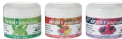
Optum F DENTALIFE

Has all the characteristics of Optum but with 0.22% sodium fluoride.