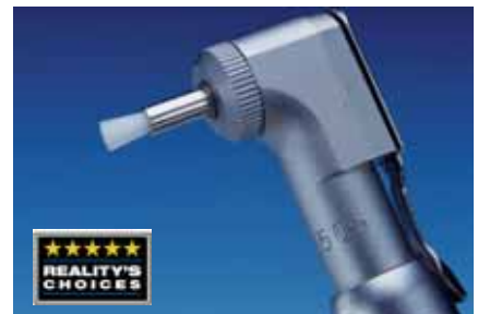
ICB® Intracoronary Bristle Brush ULTRADENT

The ICB® brush was designed to clean intracoronally as well as extracoronally before bonding fillings, inlays, onlays and crowns. It is great for cleaning areas with restricted access. It is autoclavable and designed for use with a slow speed handpiece.