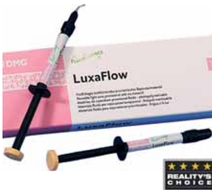
LuxaFlow Fluorescence DMG

Ideal for flowable composite Class I's, blocking out undercuts and as a solution for enamel defects. Also effective in creating a seal in the gingival margin interfaces. Delivered from a high-precision syringe tip dispensing system, LuxaFlow Fluorescence provides excellent flowability in a non-slumping formula.