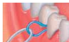
Eez-Thru Floss Threaders BUTLER

Versatile nylon loop helps patients thread floss through spaces where most other products cannot reach. Suitable for use under crowns and around orthodontic and implant appliances