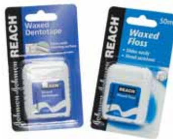
Dentotape JOHNSON & JOHNSON