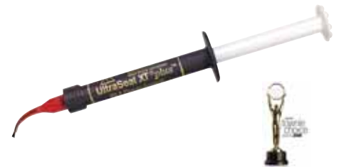
UltraSeal XT® plus™ ULTRADENT

The superhero in the battle against decay. UltraSeal XT plus pit and fissure sealant provides exciting improvements in sealant technology. The light-cured, 58% filled resin makes UltraSeal XT plus a stronger, more wear-resistant composite sealant. UltraSeal XT plus has less polymerization shrinkage than competitive products. The spiral brush action of the Inspiral Brush tip causes shear thinning of the filled, thixotropic UltraSeal XT plus, therefore decreasing its viscosity as it is placed. Resin firms when shear thinning ceases (placement complete) and helps prevent resin from running before it can be light cured. UltraSeal XT plus is significantly superior to other pit and fissure sealant materials.